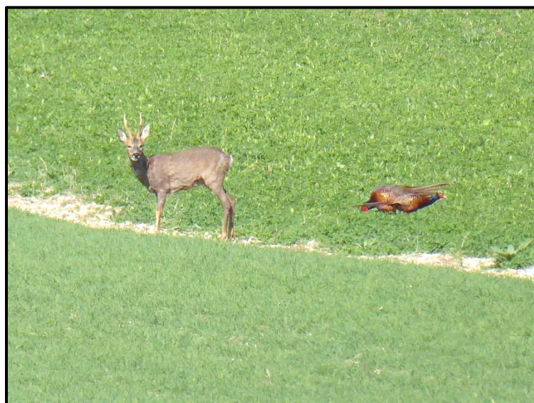
A roe deer and pheasants in a field on the north side of Caesars Belt

The footpath should take you diagonally across the field to the bottom corner but, if the path is not visible, you can skirt the field to the left and then follow the edge down to the right to reach the bottom corner (8).