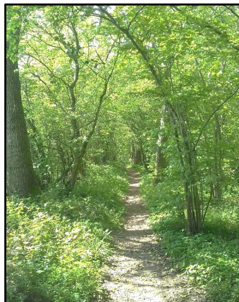
The path up from Clap Gate

20 yards to the left you will see a broad path which climbs steeply up across the field, passing a telegraph pole which is in the middle of the path. At the top, continue straight ahead to find a gap in the hedgerow and go through to enter the next field (7).